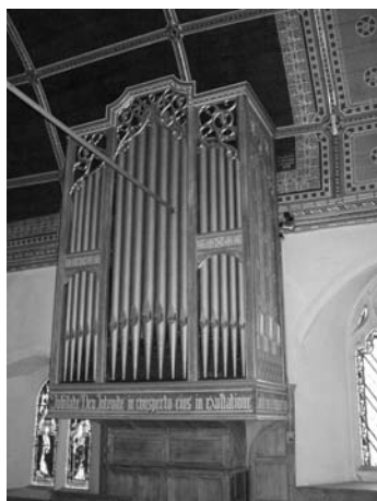
The Organ Cases of St Andrew, Nuthurst.

Sadly these beautiful cases no longer house a pipe organ, as will be noted from the list of electronic instruments given above.