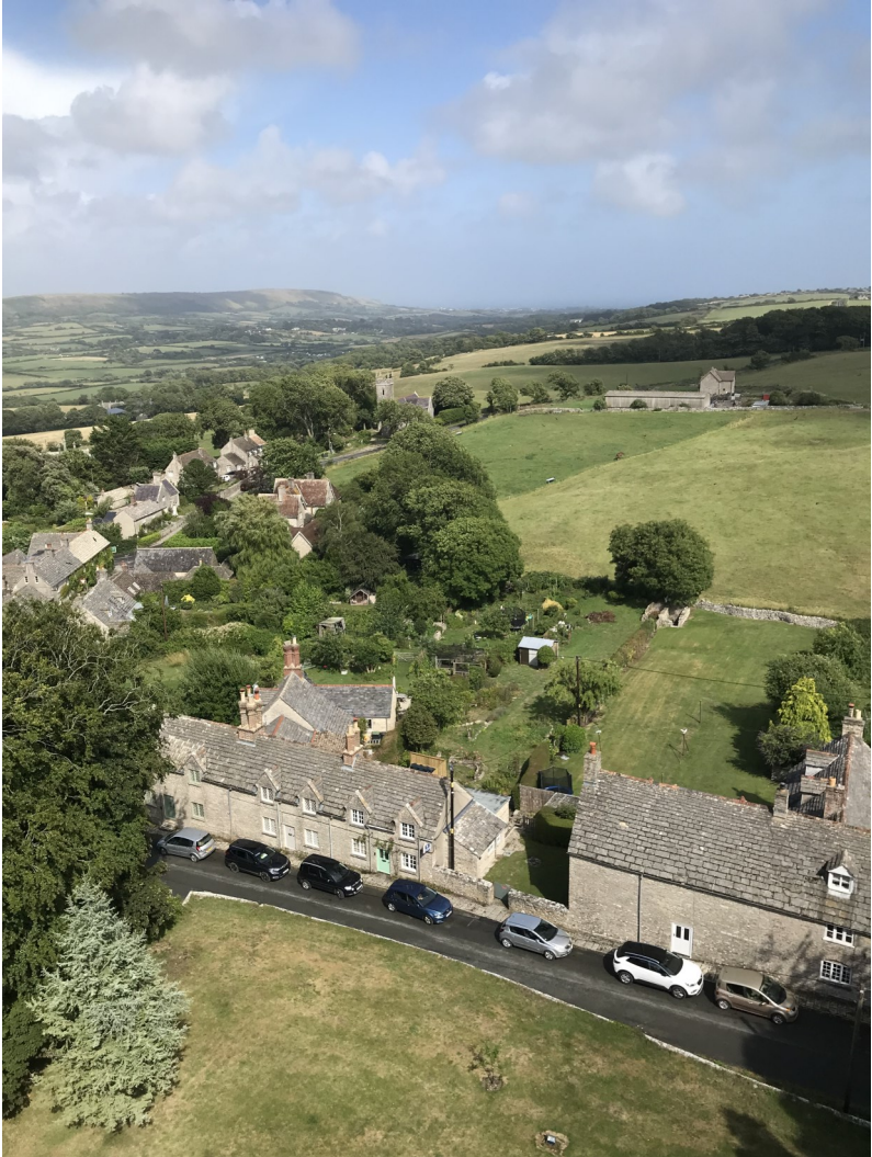
A reminder of brighter times in the summer of 2023 from the church tower at Kingston.